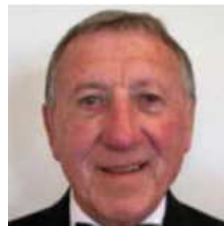
Faithful Pilot SK. Rum Hykaway