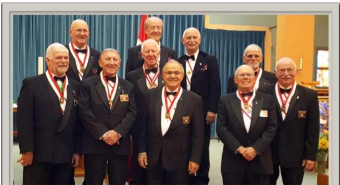
Instillation of Msgr. Albury Assembly Officers at Christ The King Church