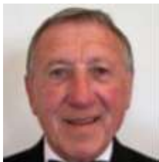
Faithful Navigator SK. Rum HUKAWAY