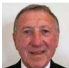
Faithful Pilot SK. Rum Hykaway