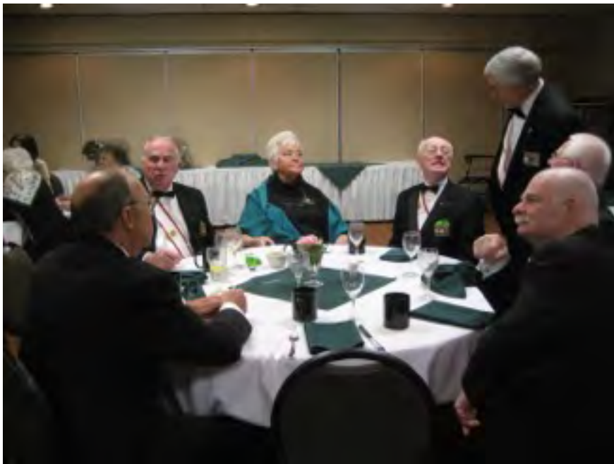
Fabulous fare and catering at the March Assembly meeting - thanks to the Campbell River "chapter" for the arrangements.