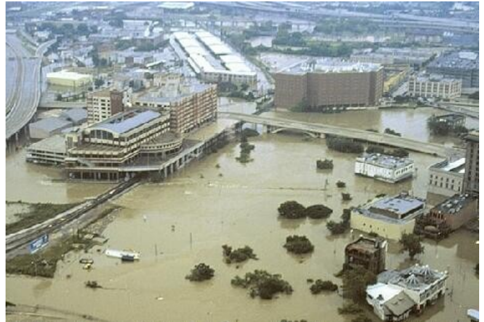
Catholic groups are mobilizing to help in Hurricane Harvey's aftermath.