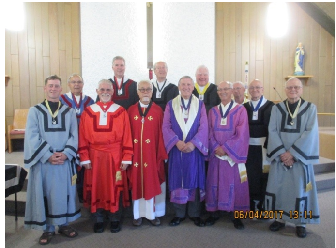
Council 7991 - Welcomes the 2017-18' Executive Council. Installation of Officers took place on June 4th following the 10.30 AM Mass.