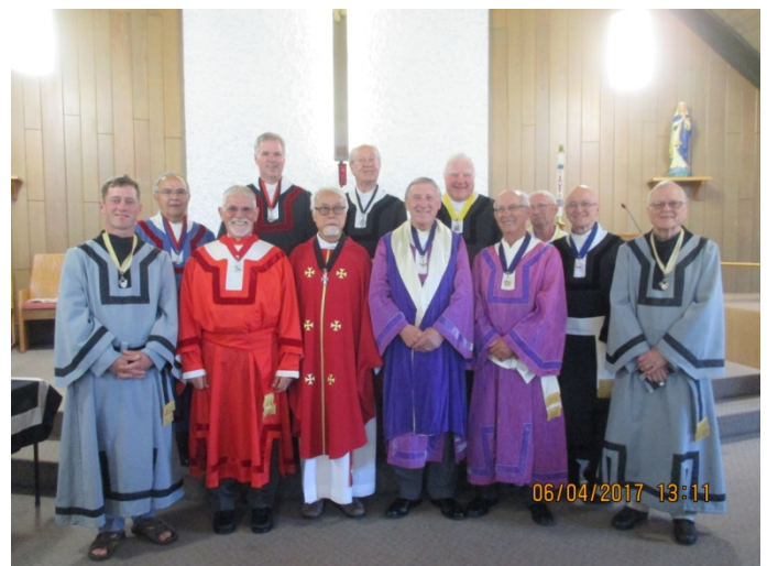
Council 7991 - Welcomes the 2017-18' Executive Council. Installation of Officers took place on June 4th following the 10.30 AM Mass.