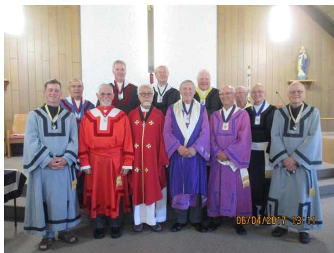
Council 7991 - Welcomes the 2017-18' Executive Council. Installation of Officers took place on June 4th following the 10.30 AM Mass.