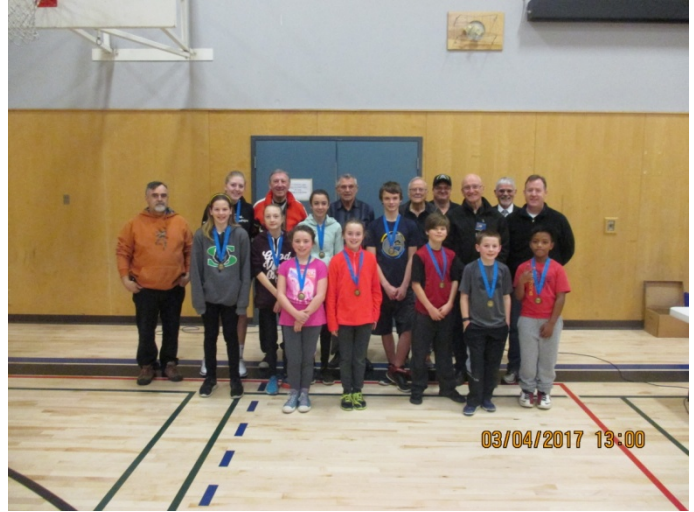
The Basketball Free Throw Champions and Volunteers from Council 7991.

Considering the many hours of labour and dedication we see by those of our Council 7991, who constantly stand up and volunteer to organize and help at the many projects in our Community we raise our hats, give a loud cheer and a Big Thank You! Well Done Lads !